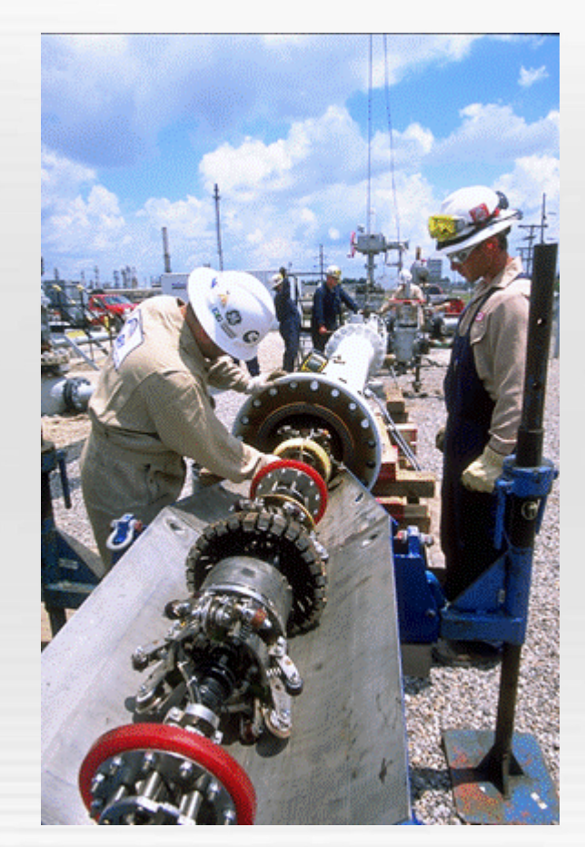
"Smart tool" or "smart pig" internal inspection device being loaded into a pipeline