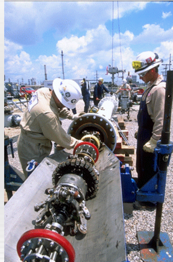
“Smart tool” or “smart pig” internal inspection device being loaded into a pipeline